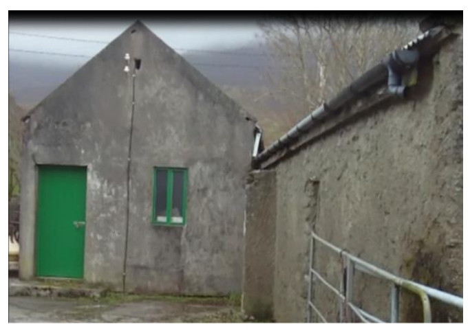
The house pictured above is a very drab house. It's cold. It's empty. And no one has lived in it for over 120 years.

Sure, there is a fresh layer of green paint on the door, but that was put there by the neighbors. Why they did that I'm not sure, because this house was abandoned long ago.