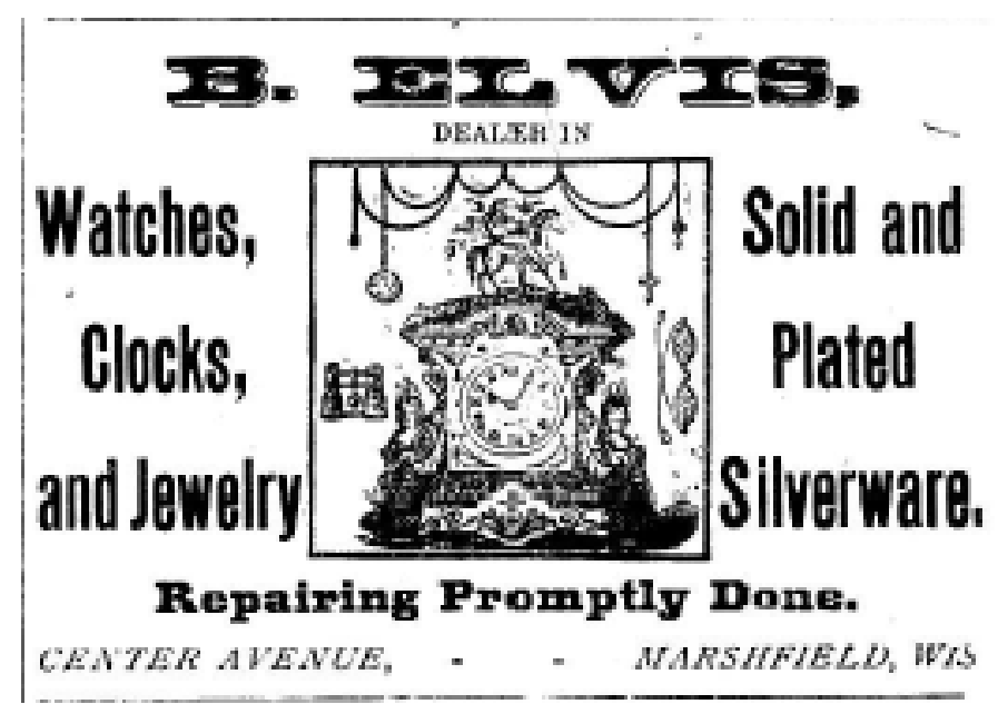
By 1898, B. Elvis operated the store at 226 South Central... Six years later, B. Elvis had moved to 221 South

Jewelry stores have had a long presence in Marshfield. In 1884, two stores sold jewelry—one, at 840 South Central (approximate site of 231 South Central, also sold toys and housed a barber... After the fire of June, 1887, during which both of these building were destroyed, it does not appear that the jewelry stores were immediately re-established. By 1891, however, three stores sold jewelry. They were located at 226 South Central (252 South Central), 221 South Central (243 South Central), and 219 South Central (231 South Central).