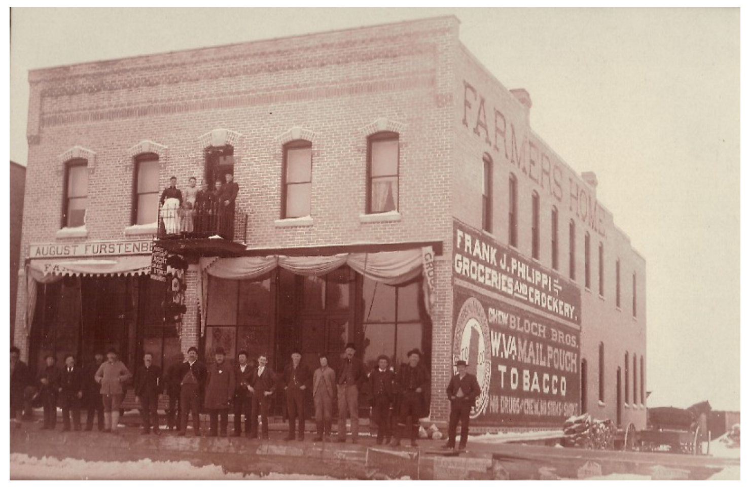
The Farmer's Home (pre-1904).

The best barn room in the city. Patronage of farmers solicited.