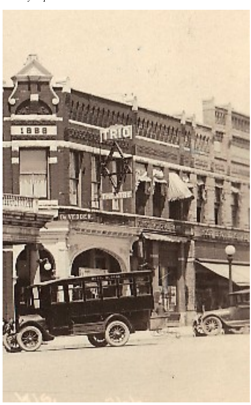
The First National Bank, located to the north (right) of the Trio Theatre and Just south (left of Rose Brothers Department Store.