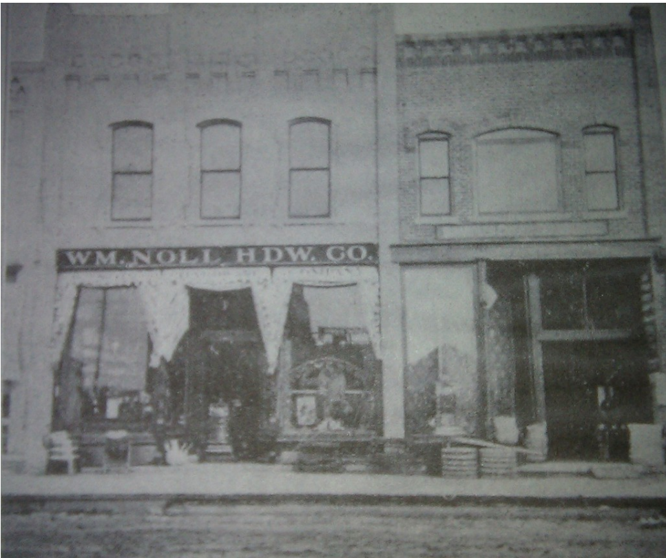
Double store of Wm. Noll Hardware Co. with addition to the south (on right) being built sometime between 1887 and 1891. (photo from Marshfield Illustrated, by C.W. Charles, 1905)