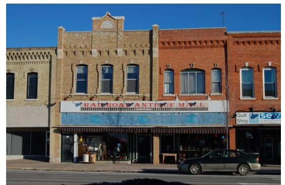
Railroad Antique Mall