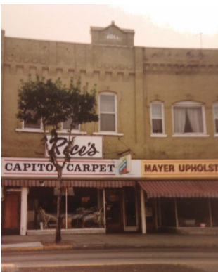
Rice's Capitol Carpet & Mayer Upholstery

Some of the other businesses that have been housed within the walls of the Noll Hardware Building are Held and Company Hardware, Blenker's TV and Appliance, Inc., The Color Spot, Rice's Capital Furniture, Mayer Upholstery and Railroad Antiques.