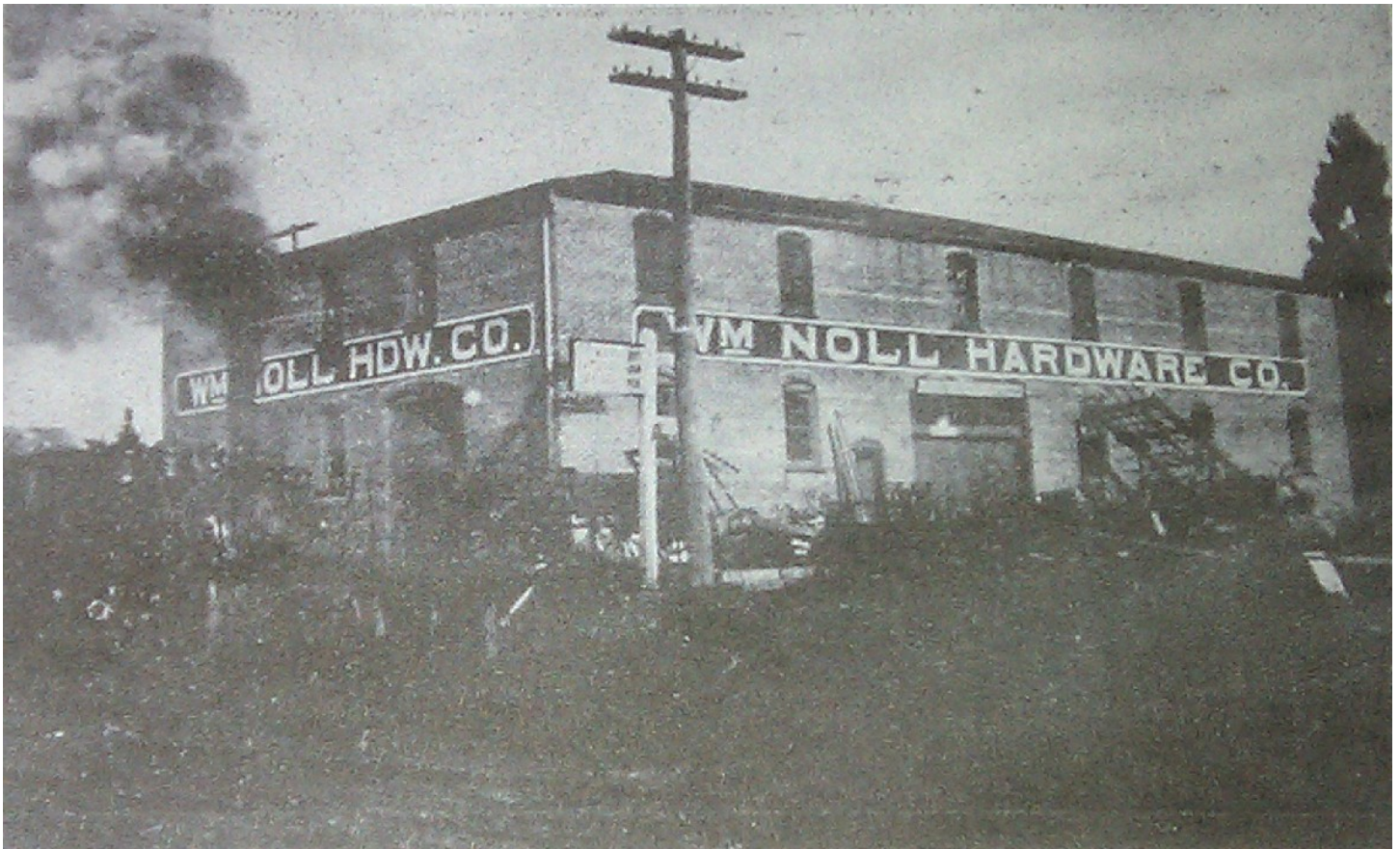
Warehouse of Wm. Noll Hardware Co. (photo from Marshfield Illustrated, by C.W. Charles, 1905)