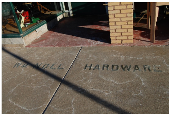
Noll name in front of door