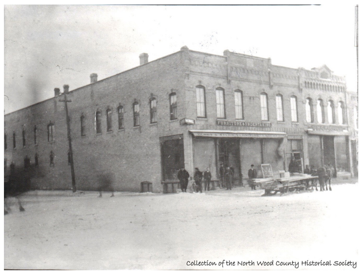
Rembs & Sturm Furniture & Undertaking at 301 South Central Avenue.