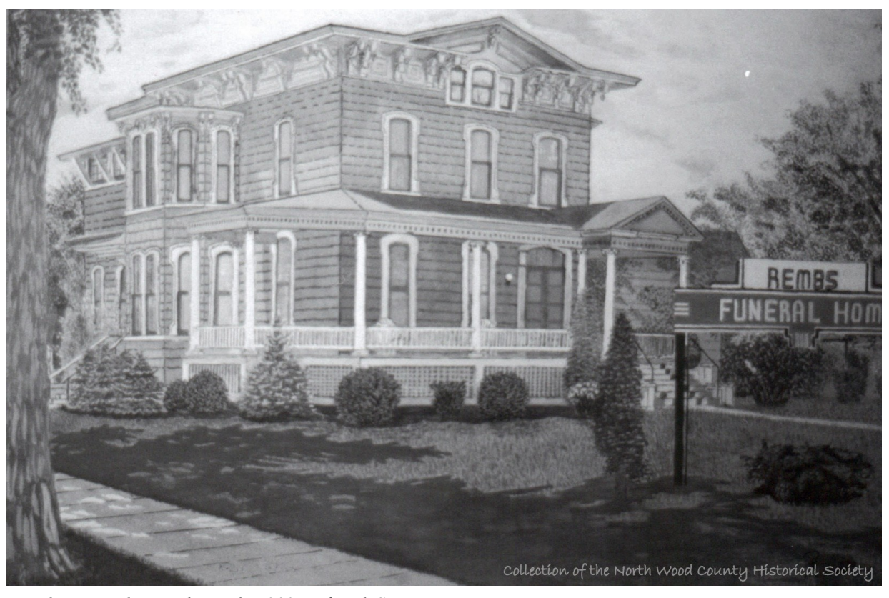
Rembs Funeral Home located at 200 W. fourth Street