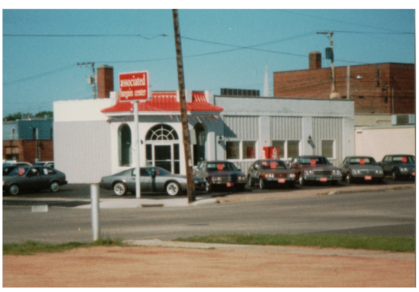
Associated Sales & Leasing Bargain Center, 11 June 1989, closed 10/10/1989