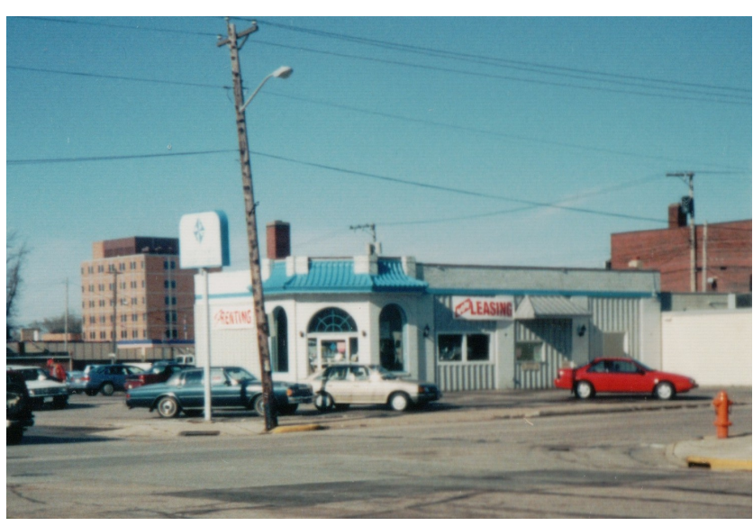
27 March 1996