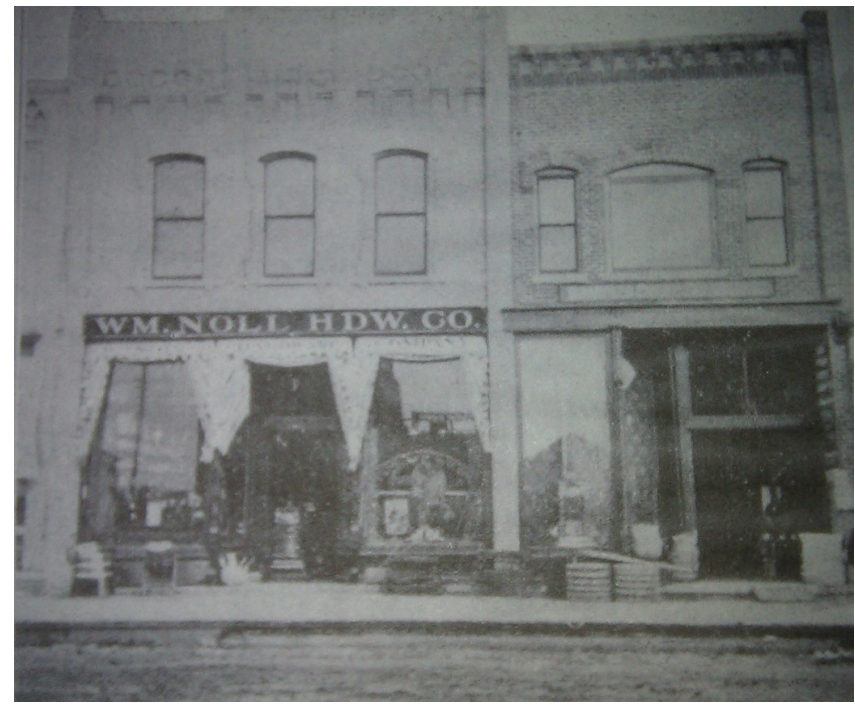
Double store of Wm. Noll Hardware Co. with addition to the south (on right) being built sometime between 1887 and 1891.