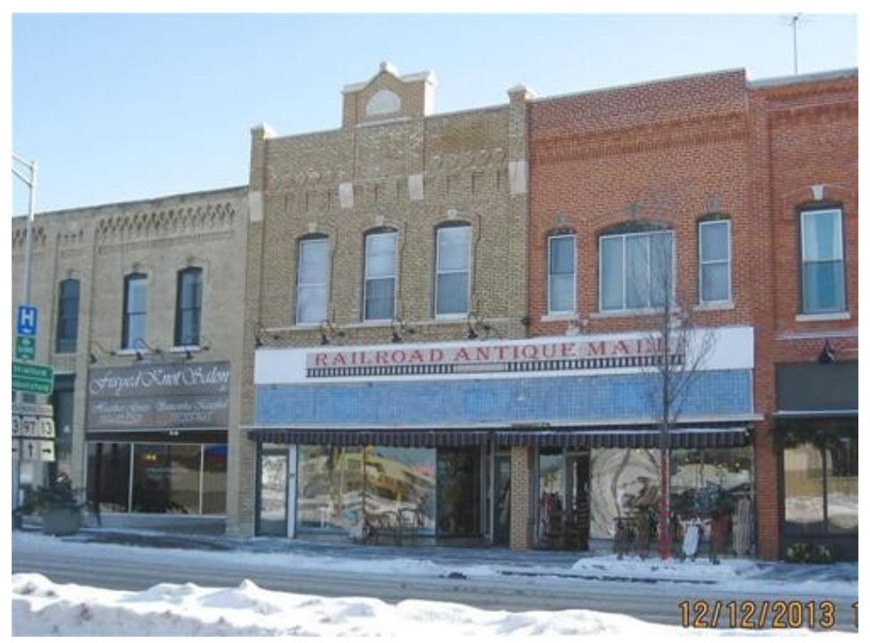
Railroad Antique Mall.