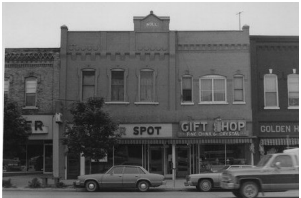
Mautz Color Spot and Noll Gift Shop, mid 1970's.