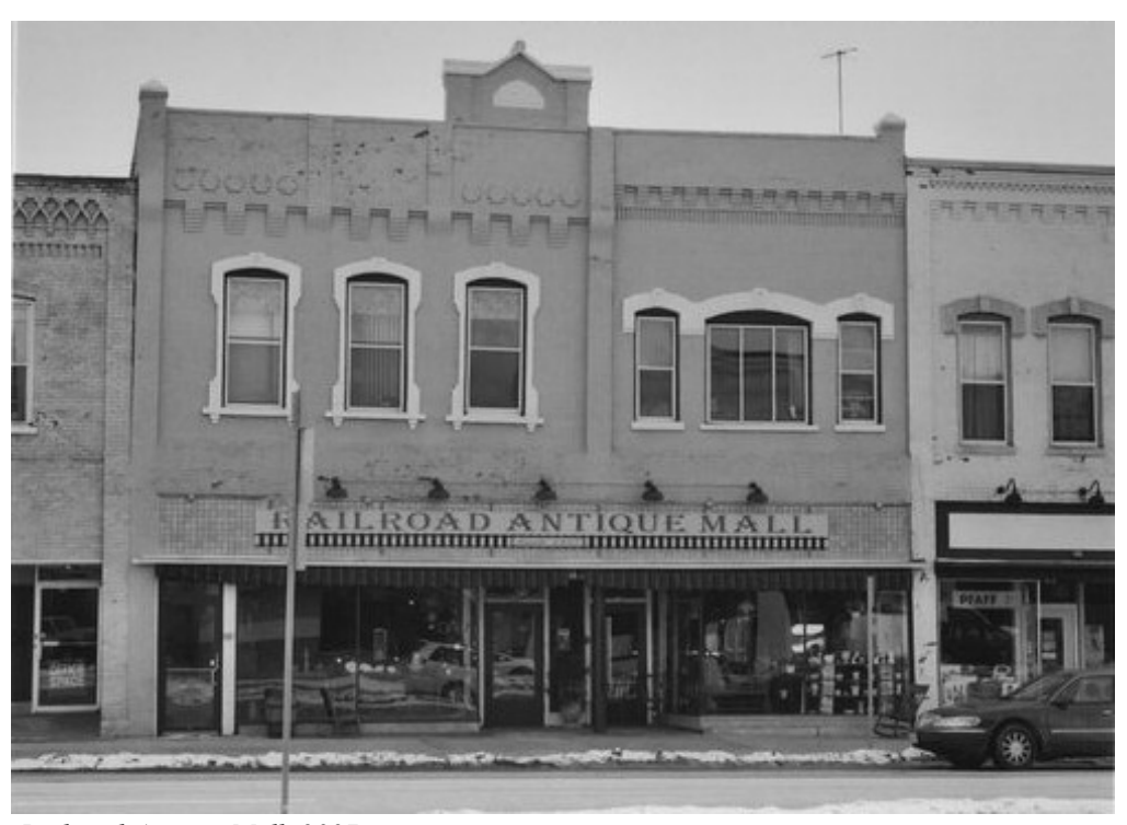
Railroad Antique Mall, 2007.

For additional stories on the historical sights and businesses of Marshfield, visit our website at: http://www.marshfieldgenealogy.com/QR-Codes-of-Historical-Marshfield.html.