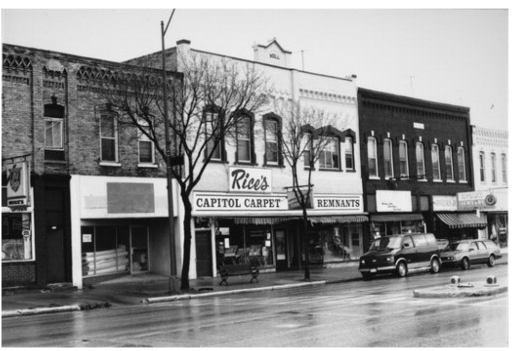
Rice Capital Carpet and Remnants

This enterprise occupied the building through 1912. In 1891 through 1904, Agricultural implements were stored and sold in the south addition. In 1925 and 1946, the building is occupied by an unidentified store. In these years, the dividing wall between the two building sections was removed on the first floor, and existed only on the second floor. The historic addresses of this property were: in 1887 (855 1/2?) South Central Avenue, from 1891 through 1946, 109 and 111 South Central Avenue. In 1946, the address given to the property was 119-121.