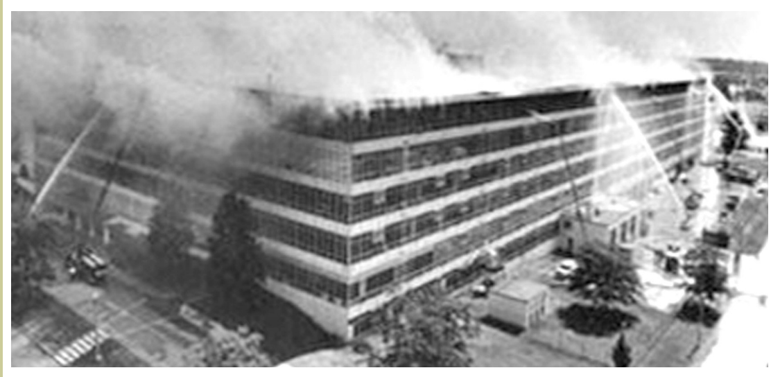
A fire at the National Personnel Records Center in St. Louis, Missouri, on July 12, 1973, destroyed approximately 16–18 million Official Military Personnel Files.