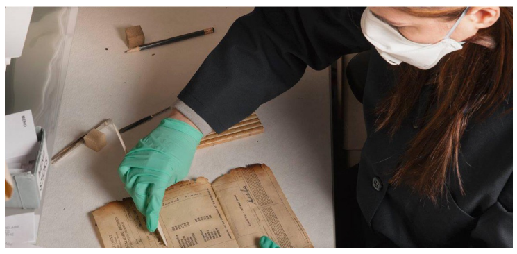
Preservation staff work meticulously to restore and preserve documents that were nearly destroyed in the fire.