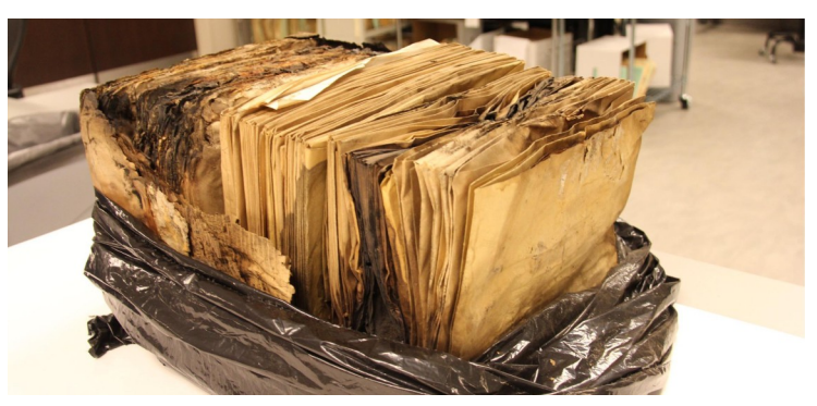
On July 12, 1973, a devastating fire at the National Personnel Records Center (NPRC) in St. Louis, Missouri, damaged or destroyed approximately 16–18 million Official Military Personnel Files documenting the service history of former military personnel discharged from 1912 to 1964. (National Archives photo)

(from <u>https://www.archives.gov/news/articles/archives-</u> recalls-fire)