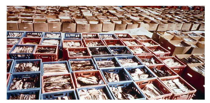
Recovery efforts at the National Personnel Records Center in St. Louis, Missouri, salvage documents after a fire on July 12, 1973, destroyed approximately 16–18 million Official Military Personnel Files.