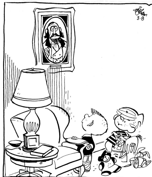
"IT'S MY GREAT-GREAT GRANDPA. HE WAS A BEATNIK."