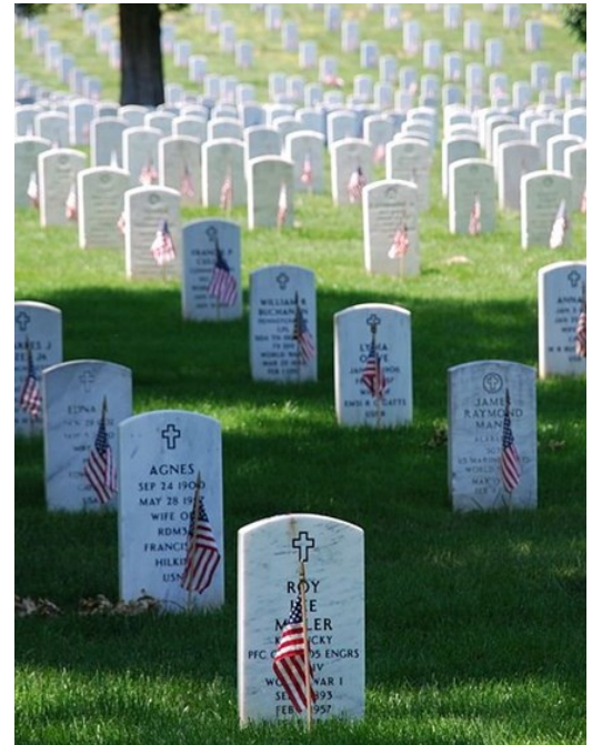
Graves at Arlington on Memorial Day

The first state to officially recognize the holiday was New York, in 1873. By 1890 it was recognized by all of the northern states. The South refused to acknowledge the day, honoring their dead on separate days until after World War I (when the holiday changed from honoring just those who died fighting in the Civil War to honoring Americans who died fighting in any war). In 1971 Memorial Day was declared a national holiday to be held on the last Monday in May. In addition, several southern states have an additional, separate day