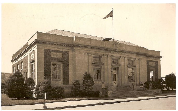
Post cards images of the Marshfield, Wisconsin Post Office.