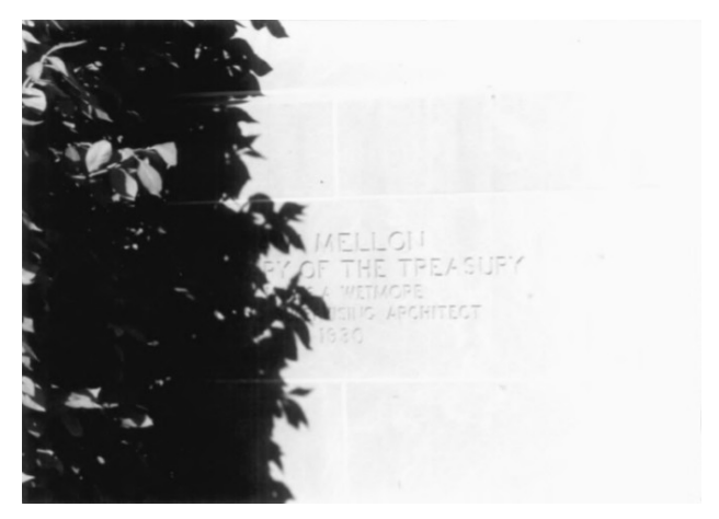
1. Building cornerstone.

The following information is the same for all photographs: Marshfield Post Office Marshfield, Wood County, Wisconsin