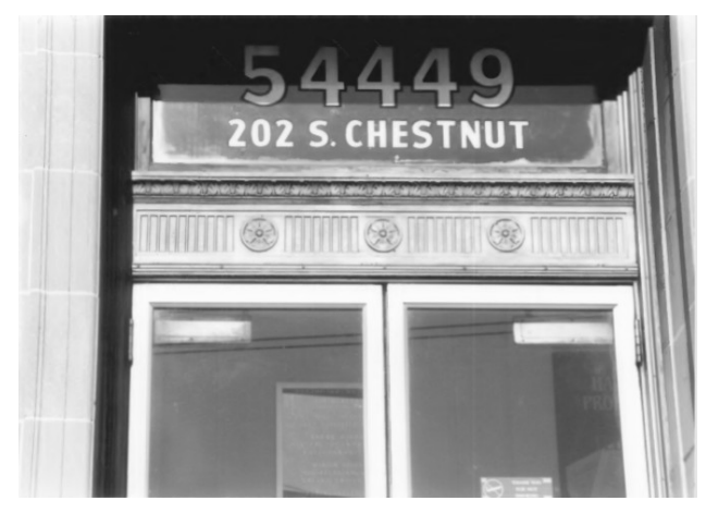
4. Façade detail.