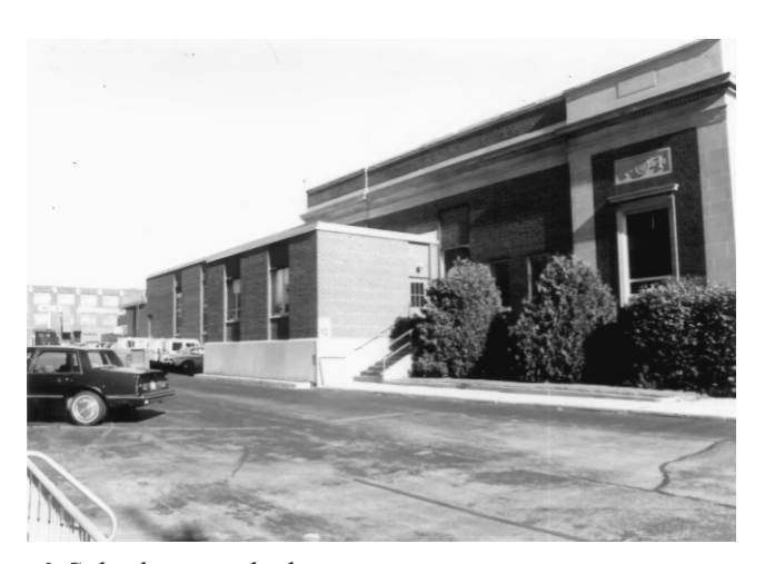
6. Side elevation, looking east.