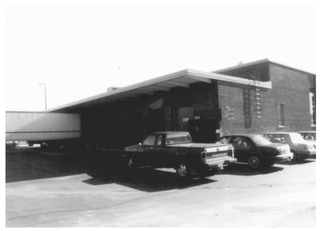
5. Rear elevation, looking northeast.