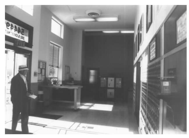
2. Interior view, lobby.