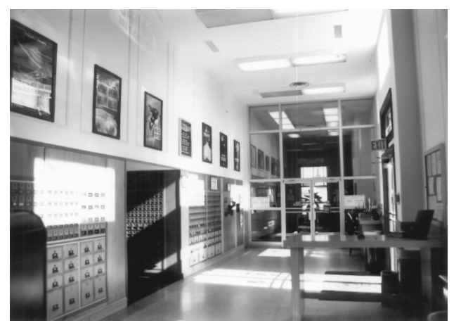
3. Interior view, lobby.