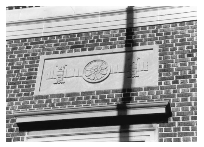
8. Façade detail.