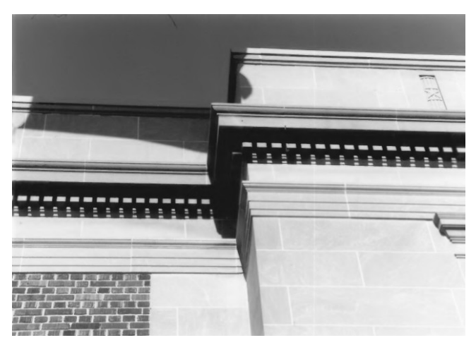
7. Façade detail.