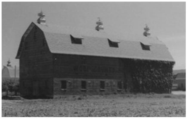
Wood County Asylum Horse Barn