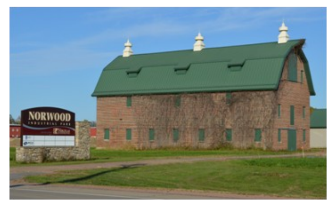
This is the last remaining building of the Wood County Asylum Hospital and Farm complex, also known as Norwood. It is now a part of the Norwood Industrial Park.

(from Marshfield News-Herald, Marshfield, Wisconsin, 06 Dec 1930, Page 5)