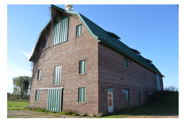
Back side of Norwood horse barn. Photo taken by Vickie Schnitzler, October 2, 2019