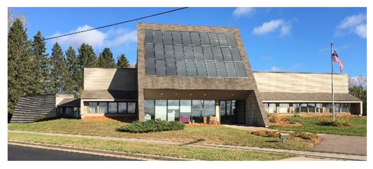
First remodel – 1985 - Modern

the reception area & 2 other stone elements each anchoring a corner of work areas. The building is rich, yet minimalistic in terms of colors, materials, signage, exterior lighting, awnings, & use of simple shapes & planes. The "layering" of parts accomplishes a sculptural, almost weightless, quality.