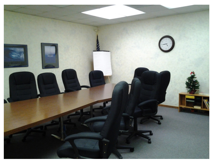
Envoy Mortgage Conference Room