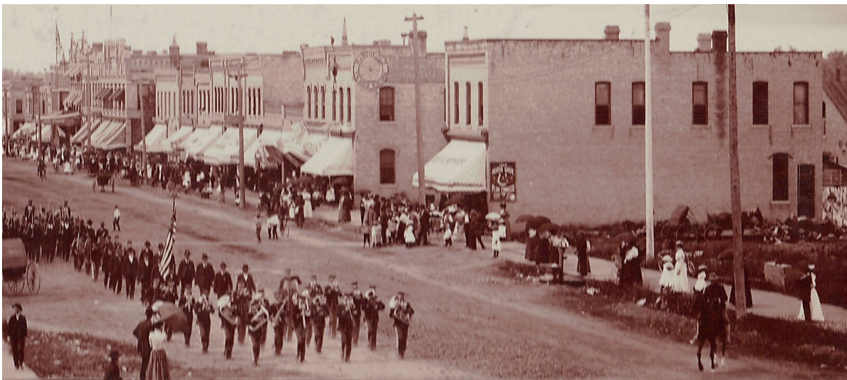
West side of the 100 block of South Central Avenue during the 4th of July Parade, 1899. The Kleinheinz Building is first.