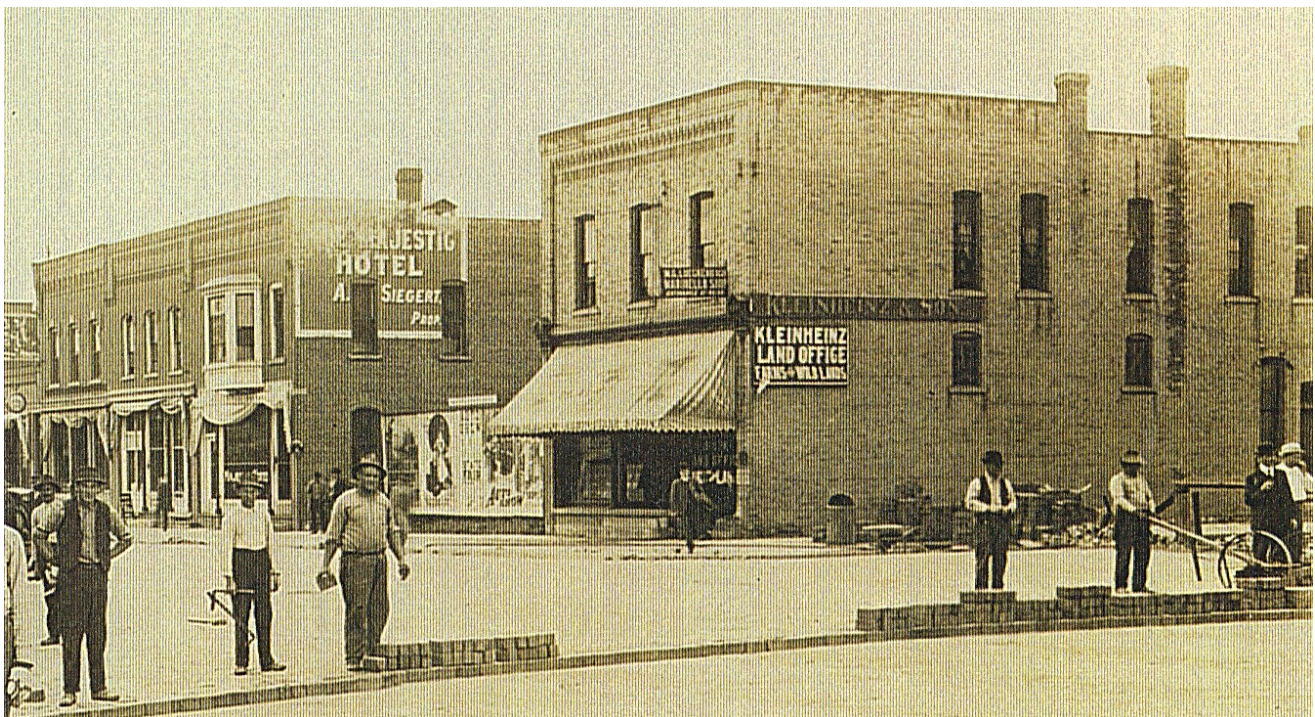
The Kleinheinz Land Office taken in 1915 during the laying of the brick on Central Avenue. (from the Donald Schnitzler collection)