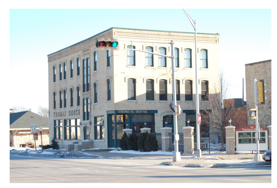
Current day Thomas House, now with front courtyard.

Some of the more current business since the moving of the building and remodeling include the Thomas House Restaurant, Nash Podvin Attorney, Bremer & Trollof Law, Thrivent Financial, Namaste Yoga, and the Marshfield Historical Preservation Society.