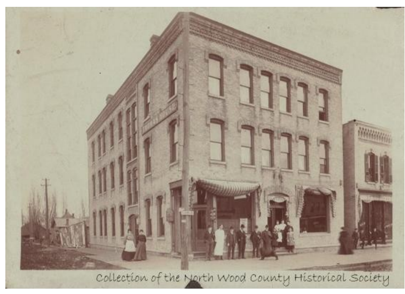
The Thomas House around 1890. Patron rates were $1.50 per day at this time.

Near the end of 1887 the first of Marshfield's three-story brick buildings, the Thomas House, was completed. The Marshfield Times gave the following description of the new building in their December 30, 1887, issue. "...it is eminently fitting to give something of a description of the Thomas House, a large, three-story brick structure on the corner of Central Avenue and South Depot Streets opposite the Wisconsin Central De-