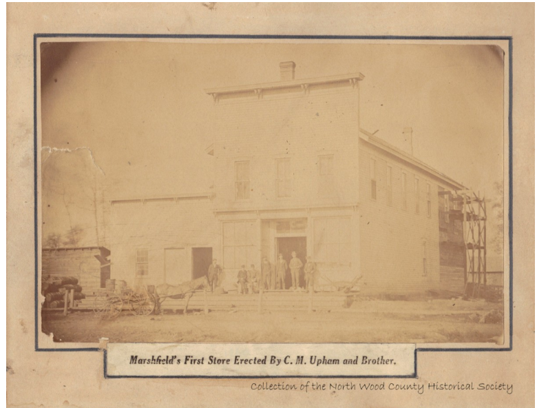
Upham Store, as it appeared when first built..

Their show window display is a model of attractive arrangement, and really no exhibition of fine art. There has just arrived at the establishment a large selection of ladies cloaks, consisting of the latest novelties of the season. The company's clothing department this year, is larger than ever, and embraces all the latest styles of men's, youths', boys and childrens' clothing. They have in stock one of the largest selections of overcoats and nisters ever seen in this section before, made by the leading manufacturers in the country.