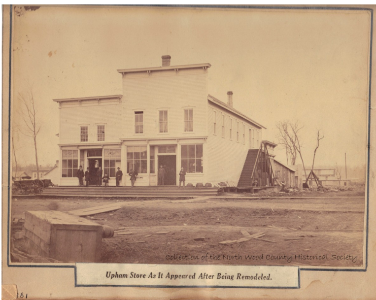
The Upham Store, southwest corner of Central Avenue and Second Street, as it appeared after being remodeled in 1880. (North Wood County Historical Society)