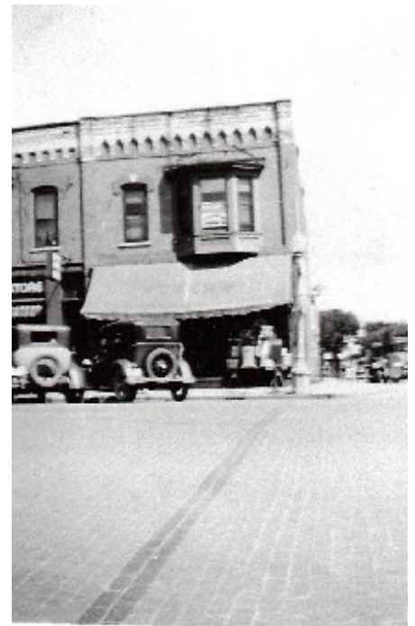
The Weber Bros. Store on the corner of S. Central and E. 4th Street, before building their new store in 1941.

The Marshfield News and Wisconsin Hub, Marshfield, WI, 02 Aug 1917, Page 1