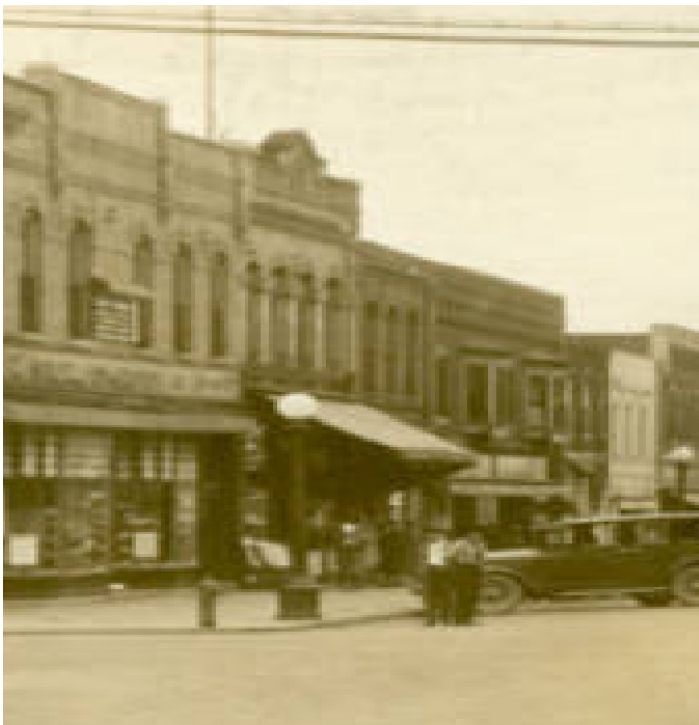
Weber Bros. Grocery at 315 S Central Avenue.