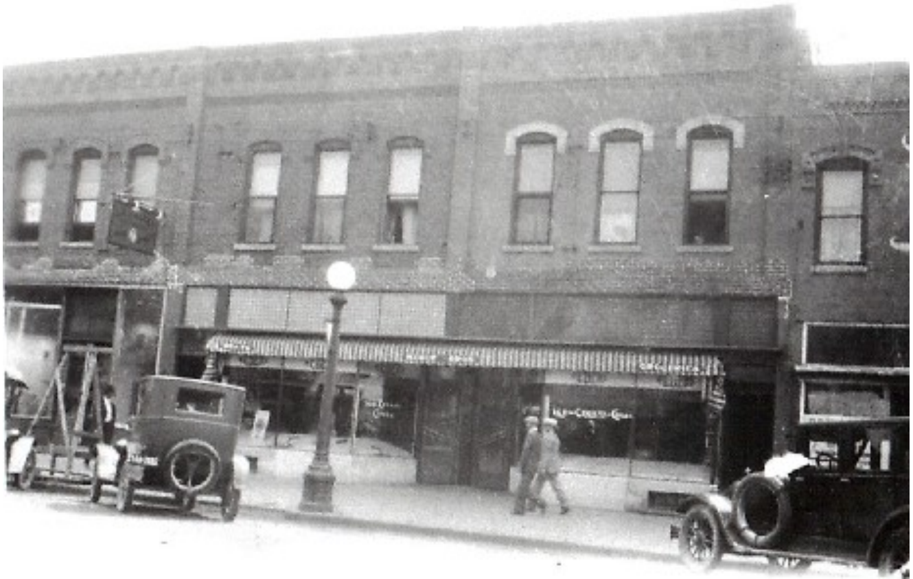
Weber Bros. Grocery at 127 S Central Avenue.