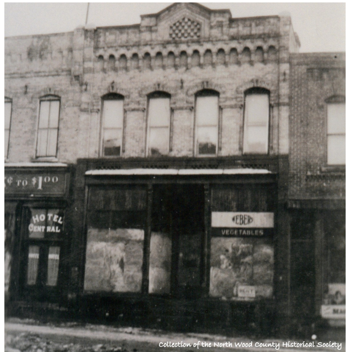
Weber Bros. Grocery at 315 S Central Avenue.