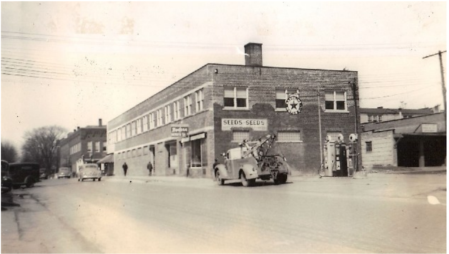
The Weber Bros. Grocery Store, corner of S. Central Ave. and 4th Street, back of store