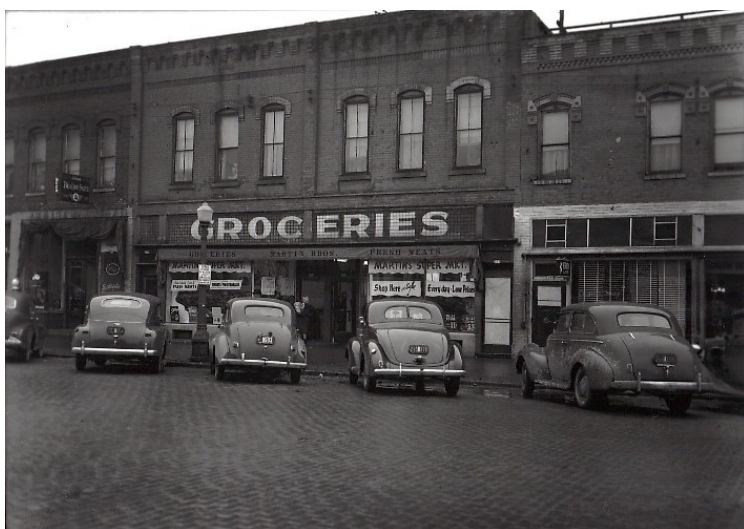
Martin Bros. Groceries and Fresh Meats at 127 S Central Avenue, prior to Weber Bros.